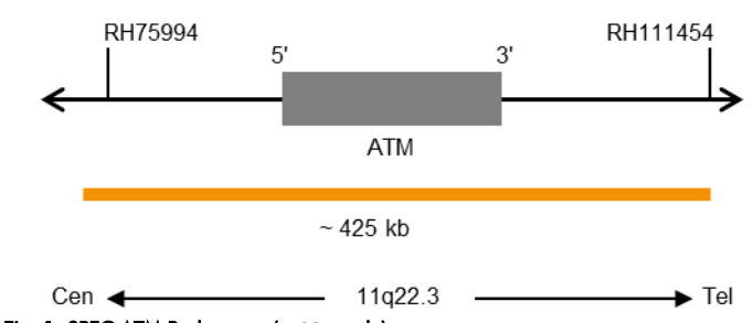
Fig. 1: SPEC ATM Probe map (not to scale)

*according to Human Genome Assembly GRCh37/hg19