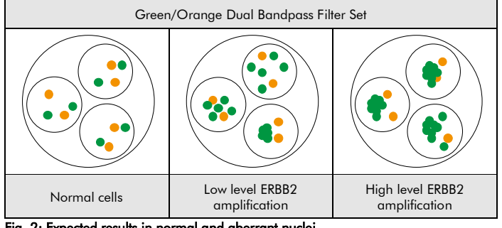
Fig. 2: Expected results in normal and aberrant nuclei

Overlapping signals may appear as yellow signals.