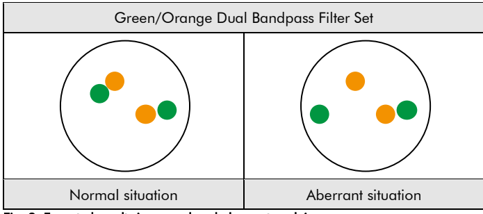
Fig. 2: Expected results in normal and aberrant nuclei

Overlapping signals may appear as yellow signals.